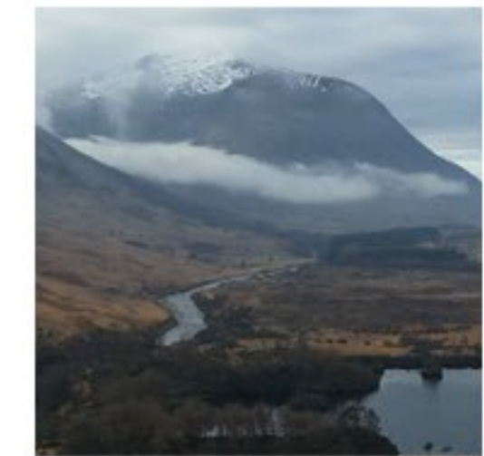
Glen Etive, UK

Reel with 6 Million views and 239k likes